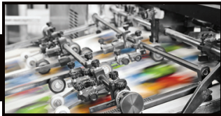
LITHO PRINTING MEDIA