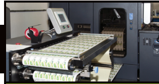
FLEXO PRINTING MEDIA